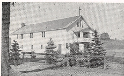
CHAPEL AND MUSEUM

LOCATED AT THE CATHERINE TEKAKWITHA MEMORIAL ONE-HALF MILE WEST OF FONDA, N. Y. ON ROUTE 5